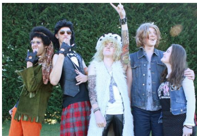
Above Rock of Ages, Thursday 29 th June and Friday 30 th June, 7.30pm, School Gymnasium.

Get your tickets now. Food / Drink available.